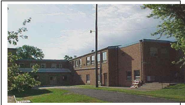
Tabor Elementary School