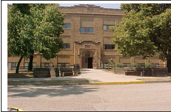
Bon Homme Middle School / High School