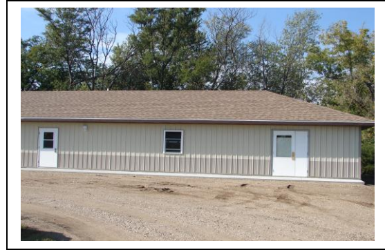
Bon Homme Hutterische Colony Alternative High School