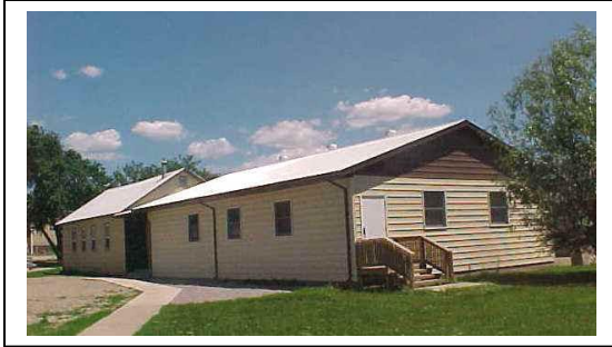
Bon Homme Hutterische Colony School