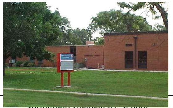
Springfield Elementary School